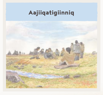
Decision making through discussion and consensus.