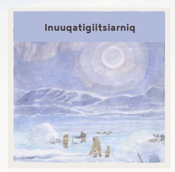
Respecting others, relationships and caring for people.