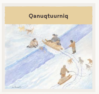
Being innovative and resourceful.