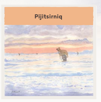
Serving and providing for family and/or community.