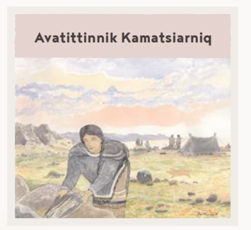
Respect and care for the land, animals and the environment.

Both the women with lived experience and the service providers expressed their views on the need for more than a law to solve family violence in Nunavut. The problem of family violence is complex and requires a more wholistic approach. Through the interviews and focus groups, Pauktuutit and the LSN heard that other forms of support and programming are needed. For example, this includes safe housing for both the abuser, as well as women and their children. The topic of Inuit specific healing services and wellness programs was brought up as a gap that needs to be addressed. Service providers also requested more training to better understand Inuit culture so that they could more effectively address family violence in Nunavut.