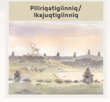
Working together for a common cause.