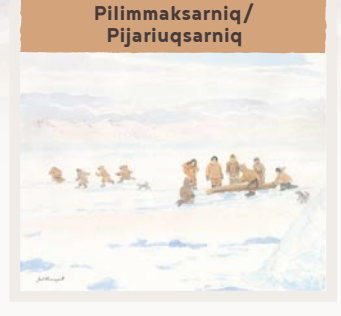
Development of skills through observation, mentoring, practice, and effort.