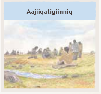
Decision making through discussion and consensus.