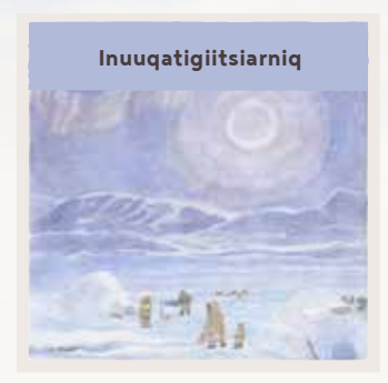
Respecting others, relationships and caring for people.