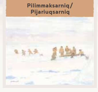
Development of skills through observation, mentoring, practice, and effort.