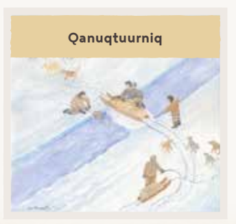
Being innovative and resourceful.