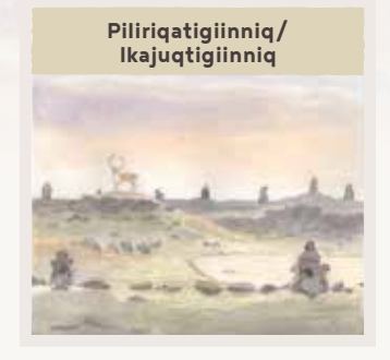
Working together for a common cause.