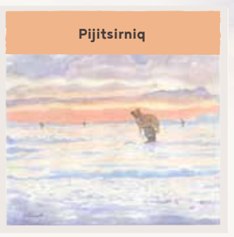
Serving and providing for family and/or community.