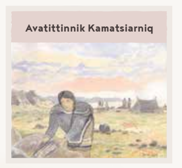
Respect and care for the land, animals and the environment.

Both the women with lived experiences and the service providers expressed their views on the need for more than a law to solve family violence in Nunavut. The problem of family violence is complex and requires a more wholistic approach. Through the interviews and focus groups, Pauktuutit and the LSN heard that there also needs to be other forms of support and programming. For example, this includes safe housing for both the abuser as well as women and their children. The topic of Inuit specific healing services and wellness programs was increased also brought up as a gap that needs to be addressed. Service providers also requested more training to better understand Inuit culture so that they could more effectively address family violence in Nunavut.